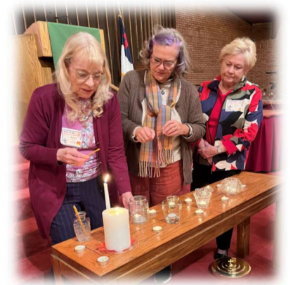
Women lighting candle