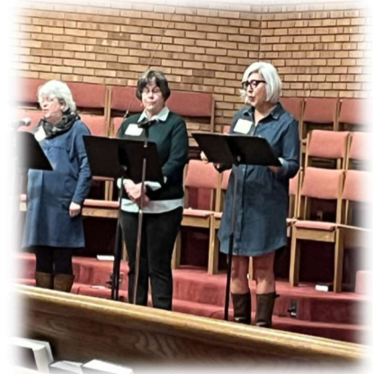
Women trio from St Mark's leading "Pass It On"